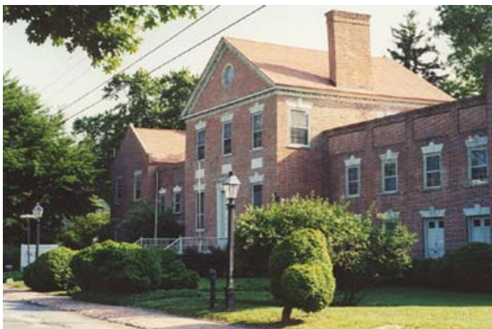
The early nineteenth-century Teackle Mansion in Princess Anne is a focal point for one of four areas identified for targeted state investment in the first phase of this plan.

The interplay between land and water is a distinguishing characteristic of the Lower Eastern Shore, with its complicated pattern of ocean, bays, sounds, rivers, marshes, and swamps. Small towns and numerous unincorporated communities, many bound by close contact with one another across the water, also contribute greatly to the region’s profoundly rural identity. The total population of the region is 155,934. As visitors move throughout the region, they experience a landscape influenced by different eras. Eighteenth-century river and bay communities give way to nineteenth-century railroad towns and twentieth-century neighborhoods.